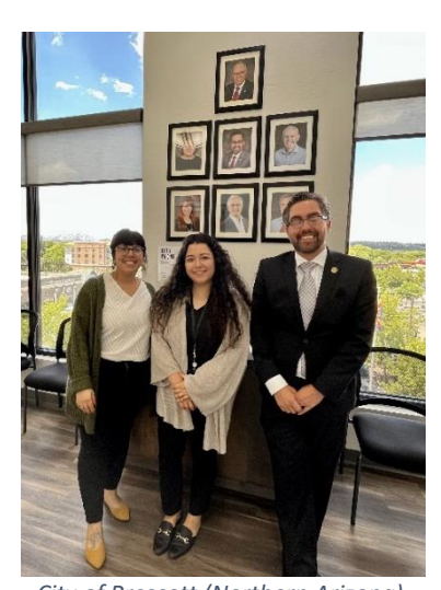
City of Prescott (Northern Arizona). July 12, 2023.