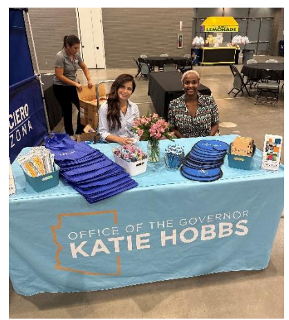
AZ Bilingual Back-to-School Event (Southern Arizona). July 27, 2023.