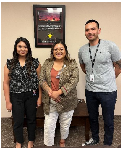
New Hope of Arizona (Maricopa). May 2023.