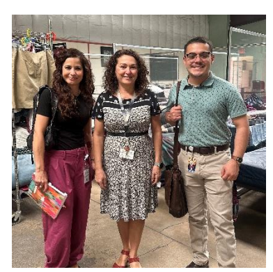
Sister Jose Women's Shelter (Southern Arizona). June 27, 2023.