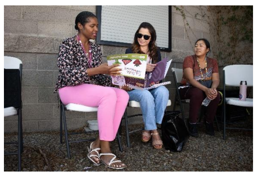
Community Food Bank - Caridad Community Event (Southern Arizona). June 16, 2023.