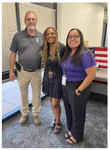
Buckeye Police Foundation (Maricopa). July 13, 2023.