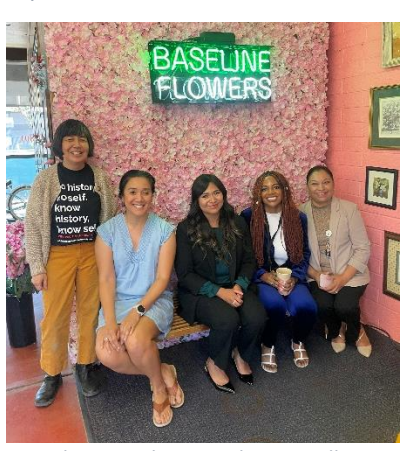
Asian American, Native Hawaiian, Pacific Islander (AANHPI) Heritage Month (Maricopa). May 24, 2023.