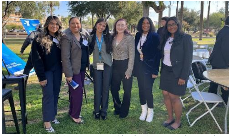
YMCA's Youth and Government Breakfast for Change Event (Maricopa). December 1, 2023.