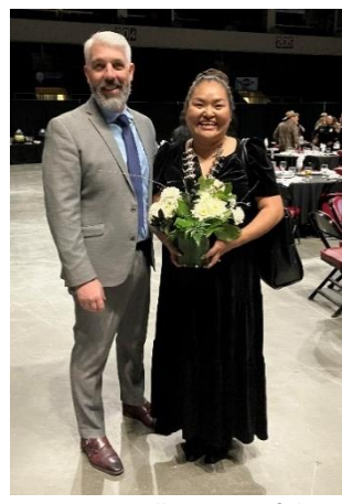
Prescott Valley State of the Town (Northern Arizona). January 30, 2024.