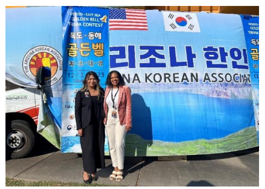
2023 Korean Culture Event (Maricopa). December 2, 2023.