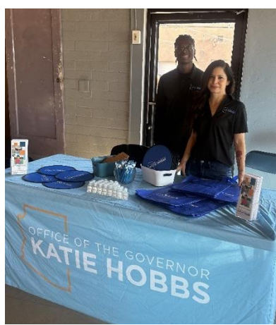
Make Way for Books Winter Wonder Fest (Southern Arizona). December 3, 2023.