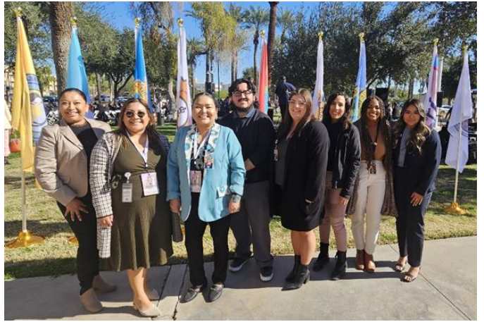
2024 Indian Nation and Tribes Legislative Day (Maricopa). January 10, 2024.