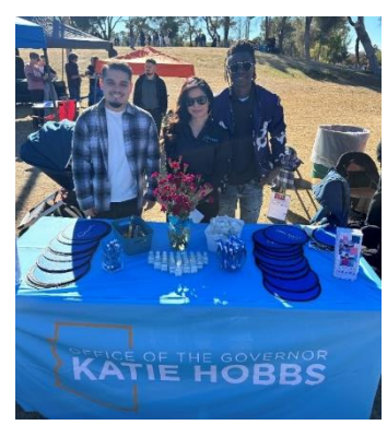
MLK Day Event (Southern Arizona). January 15, 2024.