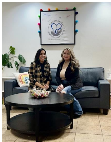
Navajo County Victim Services (Northern Arizona). December 29, 2023.