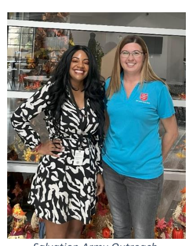
Salvation Army Outreach (Maricopa). November 15, 2023.